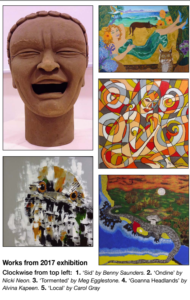
Works from 2017 exhibition

Youth Hall, 77 Bridge Street Coraki Bar, Pop Up Restaurant and Live Music