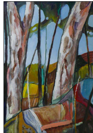
'View from Home' by Joseph Belford