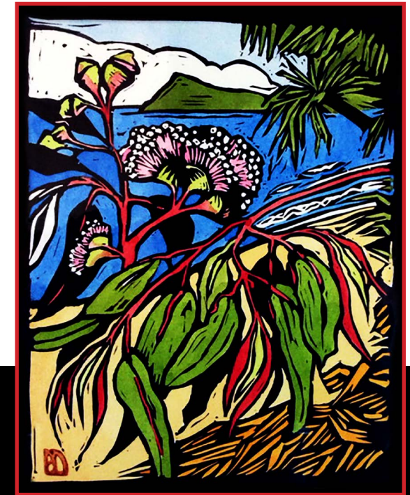
'Lennox Head Eucalyptus' - by Bratlin Desnoy